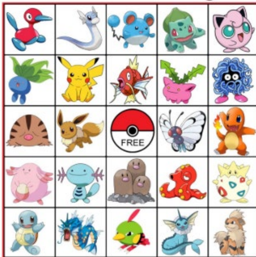
Card 1 - free download from Diana Rambles

More information: dianarambles.com/pokemon-bingo-game